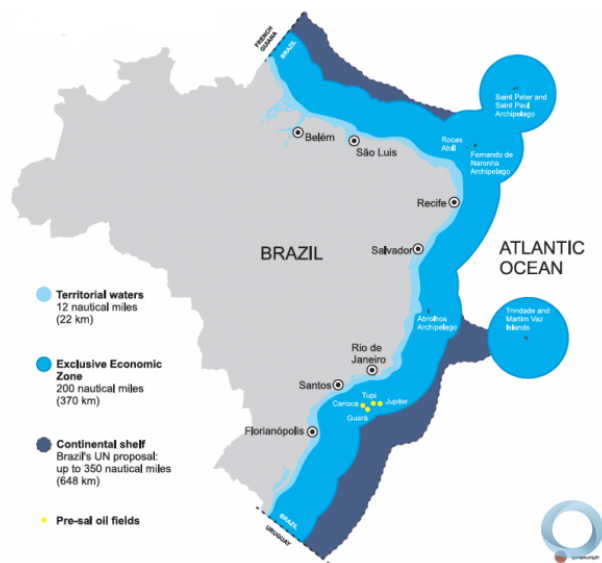
Figure 1: The Blue Amazon (extracted from [42]).

curated and worn-out information, say in Wikipedia, a Blue Amazon brain must go through a maze of scattered information to come up with useful information to users. Obviously, this state of affairs makes our goals even more challenging and requires us to move in small steps.