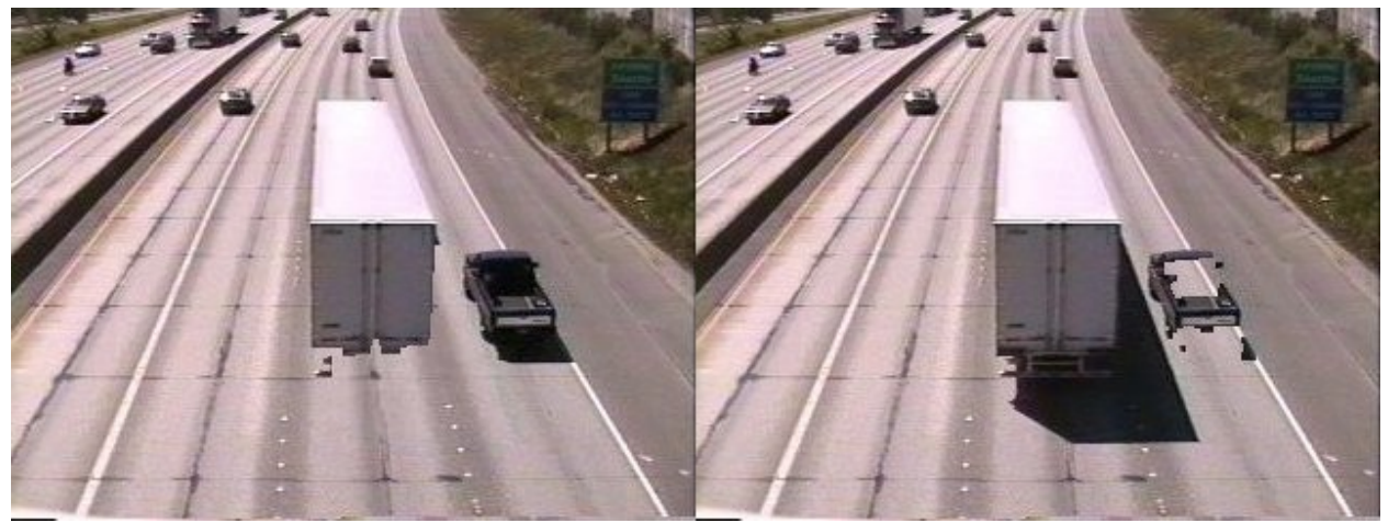
FIGURE 3 Dual-pass Otsu method for a light (left) and dark (right) vehicle.

The principal advantage of this algorithm lies in its computational inexpensiveness. Figure 3 demonstrates that although this method performs well for bright vehicles with dark cast shadows, it does not perform nearly as well when darker vehicles are considered.