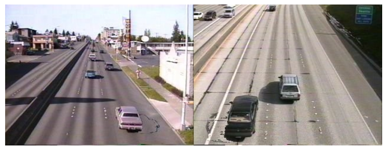
FIGURE 5 Region growing method for a light (left) and dark (right) vehicle.

Figure 5 exemplifies the sound performance of this method when the shadows are of uniform intensity, regardless of whether the vehicle color is light or dark.