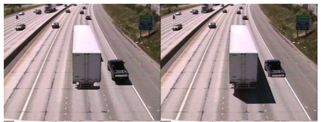
FIGURE 7 Edge subtraction and morphology method for a light (left) and dark (right) vehicle.

This method performed the best of the three methods presented. Figure 7 displays the results of this method when applied to scenes containing light and dark vehicles.