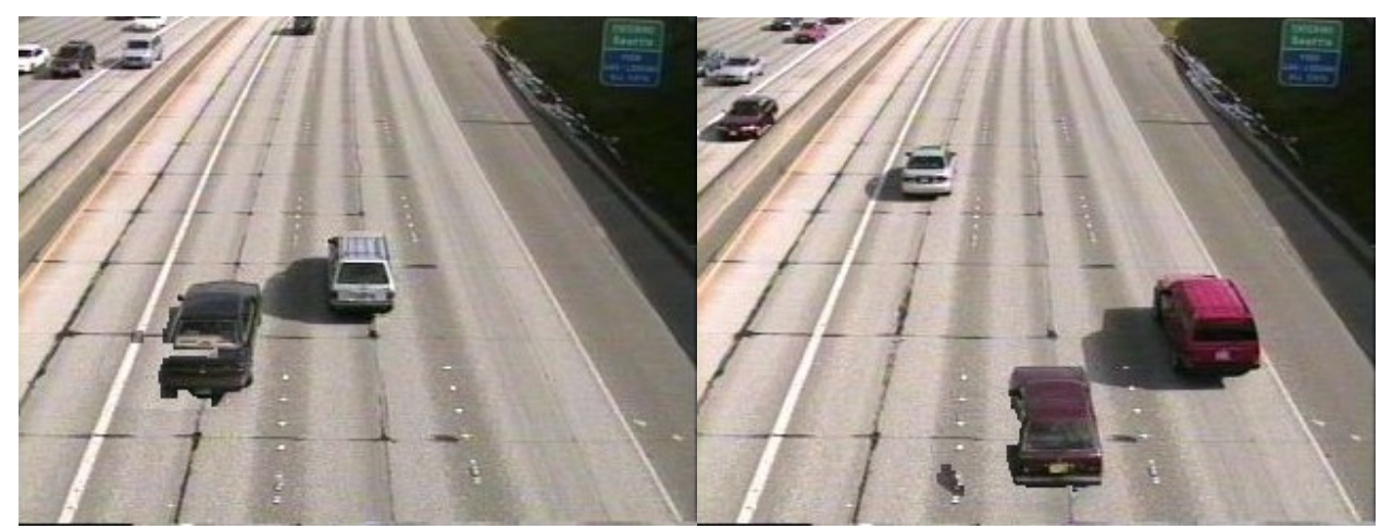
FIGURE 8 Edge subtraction and morphology method results in low-angle illumination.

The principal drawback to this method is that it is the most computationally expensive of all the proposed methods, as indicated earlier. Although the edge image for the background would only have to be extracted whenever the background was updated, continuous vehicle detections and production of edge images can strain a real-time system, particularly when large vehicles are detected. Thus, it is proposed that when a less powerful computer is used, a screening method may be necessary to choose the appropriate technique depending on the conditions; vehicles with uniform shadows and high average intensities can utilize the dual-pass Otsu method, while other vehicles with uniform shadows can implement the region growing method. Only the more complex shadows involving low-angle illumination would require the edge subtraction technique, thereby reducing the computing demands placed on the system.