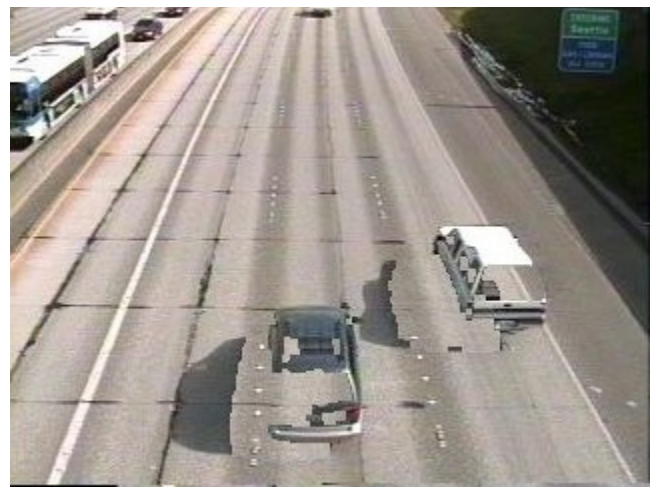
FIGURE 4 Dual-pass Otsu method in low-angle illumination.

Furthermore, this method is not spatially aware; a pixel may be classified as a shadow regardless of its neighboring pixels, thereby ignoring valuable information. Nonetheless, this method is quick and effective when a vehicle occupies a high intensity range. An intensity histogram of the vehicle-shadow area could be used to determine whether this approach would be adequate; if not, a more in depth shadow removal operation could be chosen.