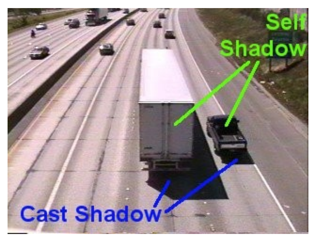
FIGURE 1 Illustration of self shadows and cast shadows.

As noted by Wang et al. (5), shadows may consist of two components: self shadow and cast shadow. Cast shadows are shadows cast by the object of interest upon other objects and are the type that typically comes to mind when we think of shadows. Alternatively, self shadow is the shadow an object may cast upon itself when hidden from the illumination source. These cases are illustrated in Figure 1. The distinction between these types of shadows is important for object recognition – successful shadow removal aims to remove cast shadows while recognizing self shadow as part of the object of interest and therefore preserving them. Unfortunately, the similar characteristics between cast and self shadows often complicate a computer's ability to distinguish between them.