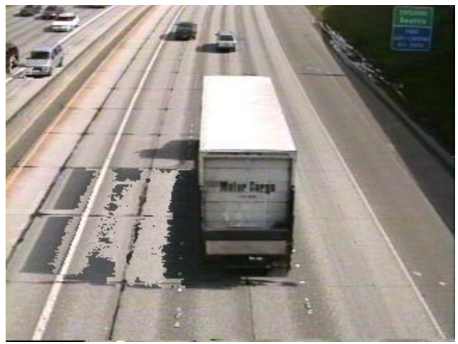
FIGURE 6 Region growing method in low-angle illumination.

Selection of a broader threshold for inclusion in the shadow group could compensate for this effect; in this case an automatic method to determine the appropriate threshold must be developed. Alternatively, the identification of edges in the background image (which would correspond to pavement markings and cracks) could be used to allow the region growing method to 'hop over' these pixels to continue shadow identification.